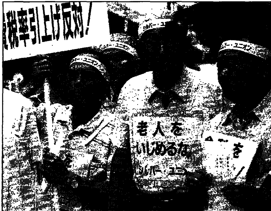
Elderly members of the 600-Silver union wear headbands during a demonstration in front of the Bank of Japan in Tokyo yesterday to raise interest rates and scrap the decision to increase the consumption tax to five percent.